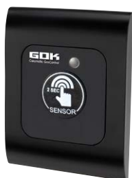
Caramatic GasControl control unit