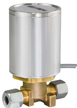
Caramatic GasControl solenoid valve