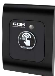
Caramatic GasControl control unit